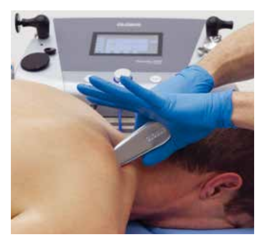
DiaTriggerPoint Tool for the treatment of Trigger Points.