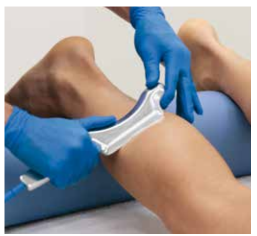
DiaBlade Large Tool for Lower Limb and Trunk treatment.