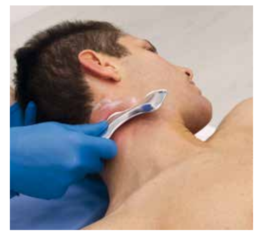
DiaBlade Small Tool for Upper Limb and Cervical Rachis treatment.